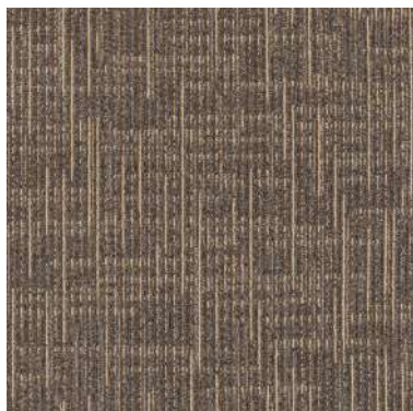
Liberty 8803 Brown